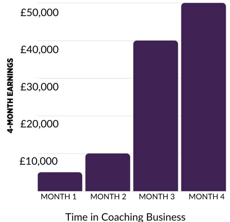
AVERAGE COACHING CLIENT REVENUE FORECAST

Learn the key steps, processes, and strategies to start or grow a coaching business that can generate £100k or more within 90 days, even if you're just starting out.